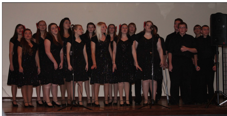
Cloverleaf Swing Choir