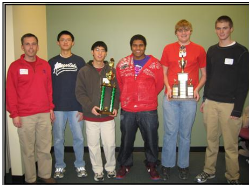
Revere High School 2009 Academic Challenge Team