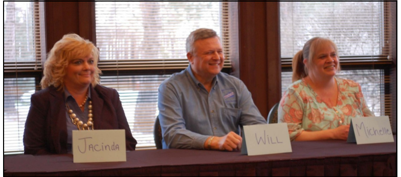
Medina County Schools' ESC—Brain Teasers

The knowledge was moving fast and furious at Williams on the Lake on Thursday, March 21, when eight organizations in Medina County tried to displace last year's winners, Westfield Insurance Co., for top honors.