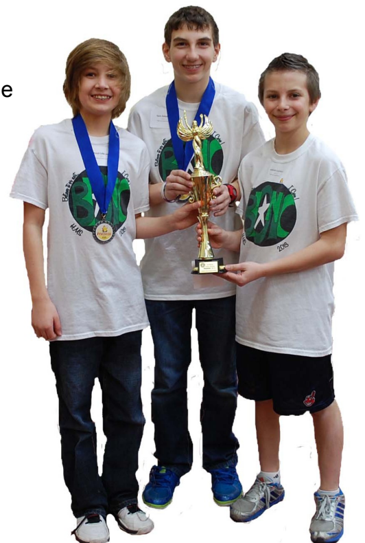
Robonerds. Highland Middle School

M.A.D Bots—4th place, Root Middle School